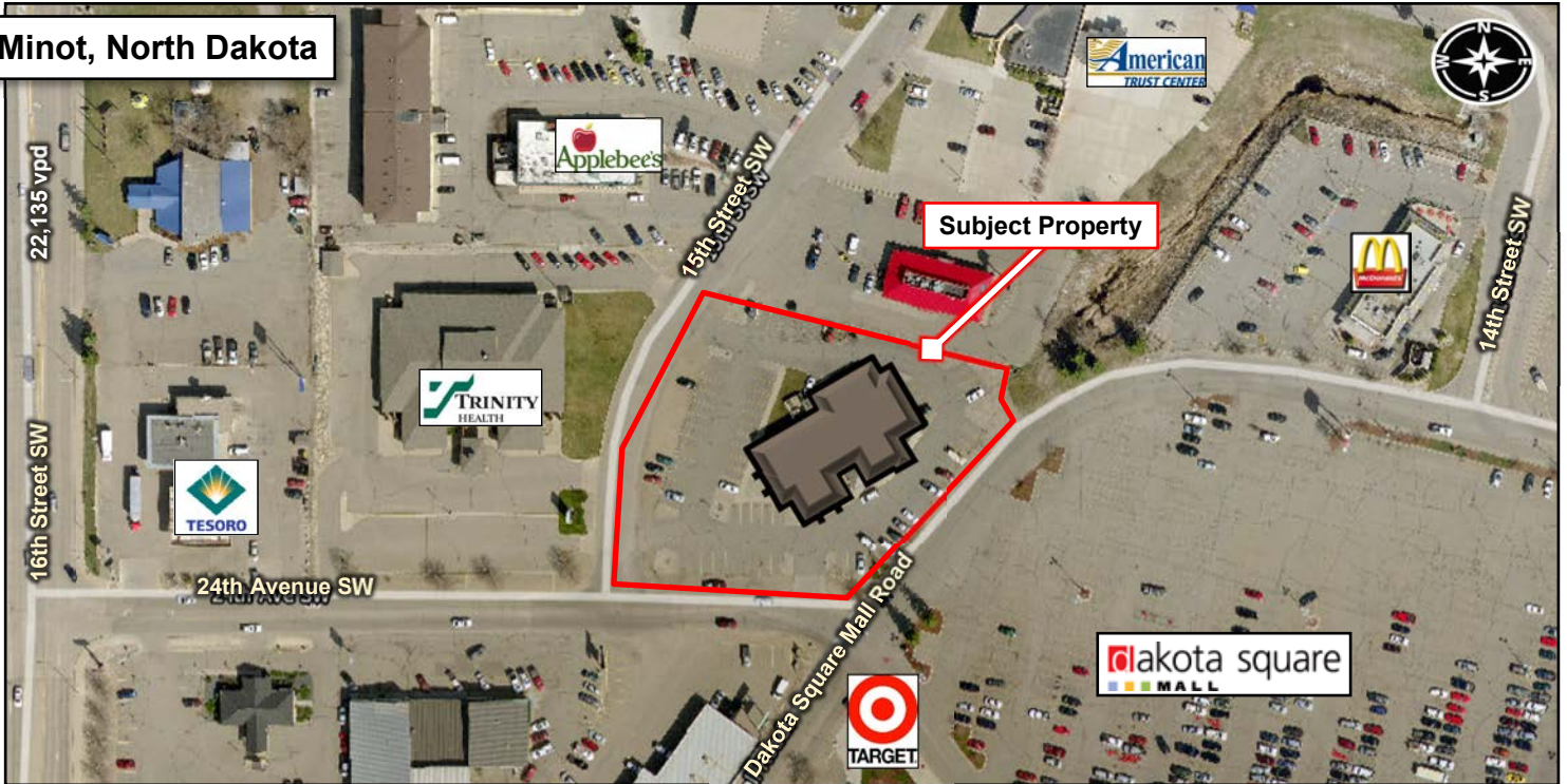
Minot, North Dakota