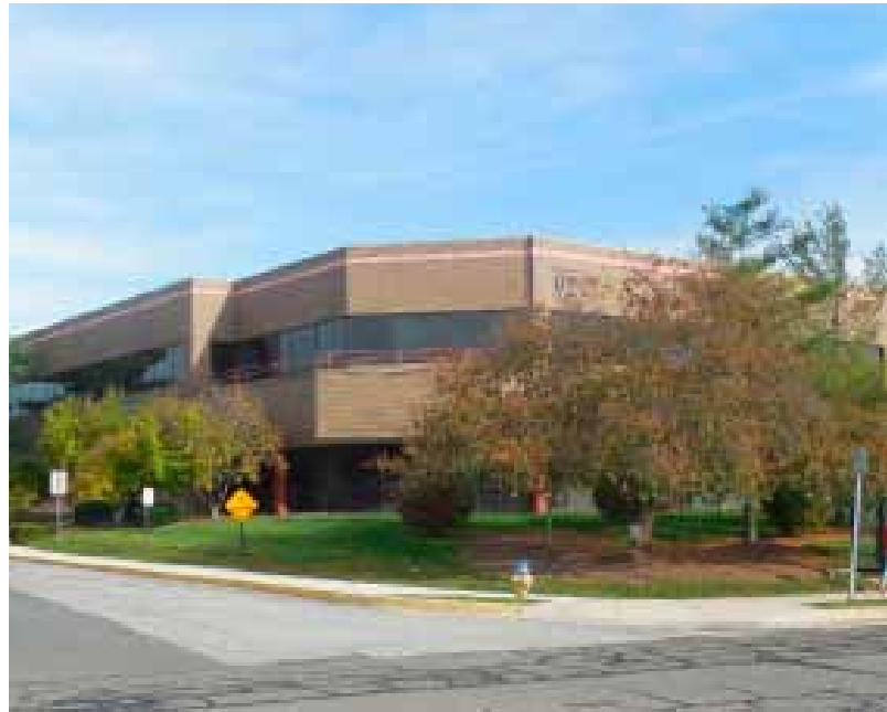
92 Reads Way