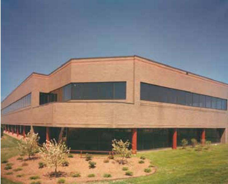
2 Reads Way