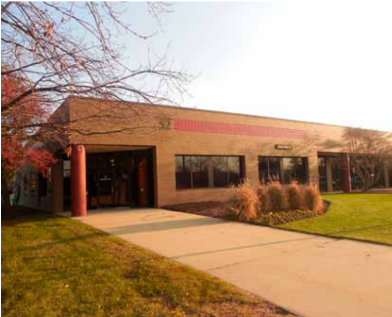
52 Reads Way