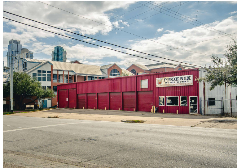
Top, left, right: Current interior, current back parking area, exterior