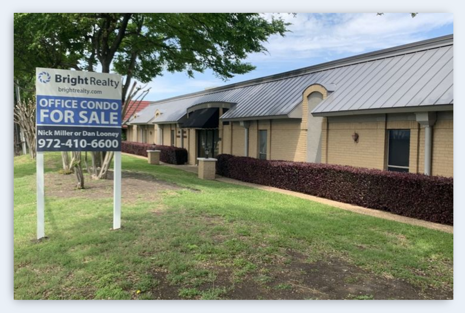
600 W. CAMPBELL RD. RICHARDSON, TX 75080