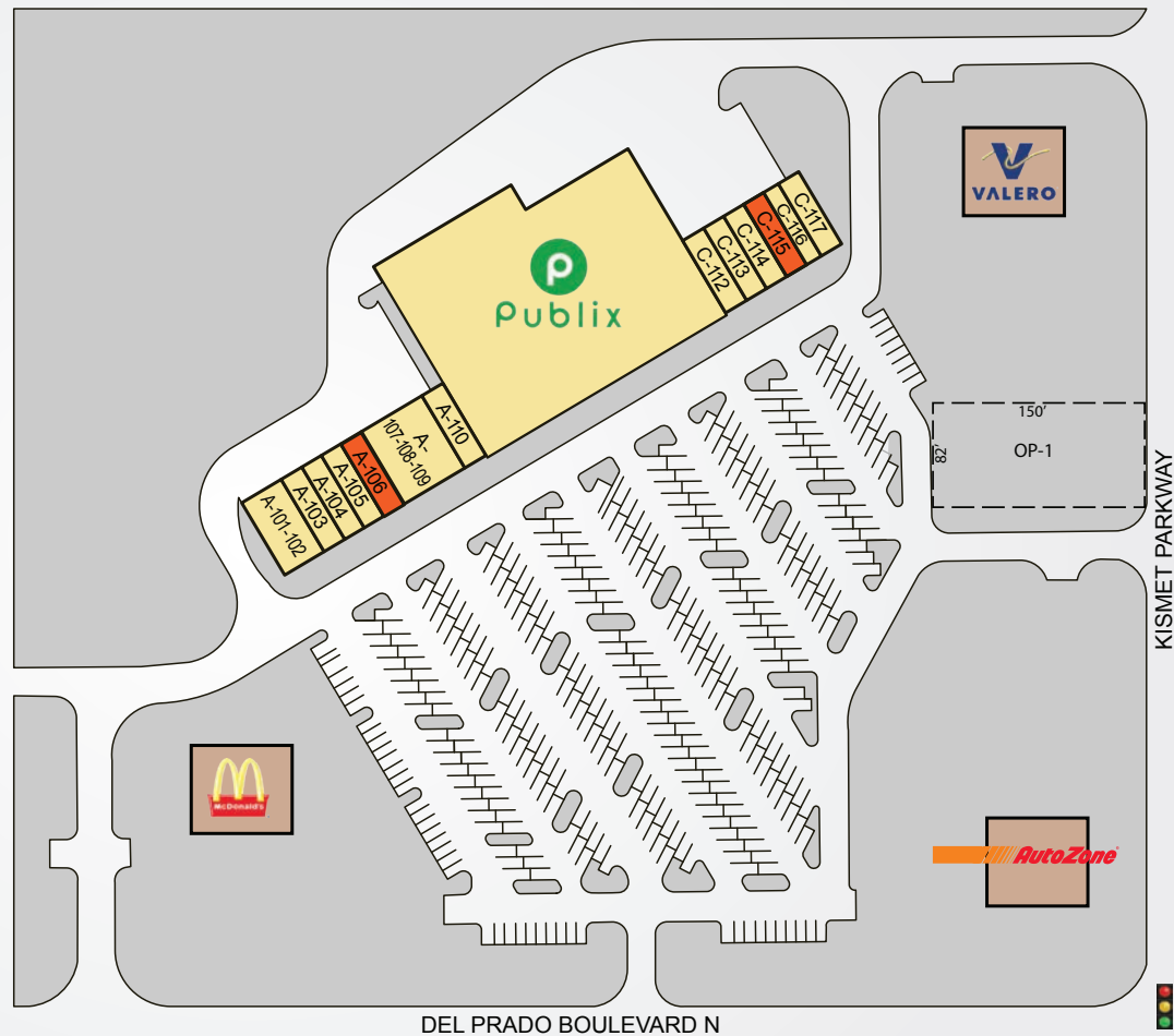
DEL PRADO BOULEVARD N 2481 Del Prado Blvd. N, Cape Coral, FL 33909

Shoppes at North Cape is situated at the intersection of North Del Prado Blvd and Kismet Parkway. Coral Lakes, a 370 acre master-planned gated community with 429 single family and 308 Townhomes sits just north of the center and Concardia at Cape Coral, a 340 unit condo complex just east. Tenants benefit from the high-income levels of surrounding households and an expansive customer base provided by the new surrounding developments.