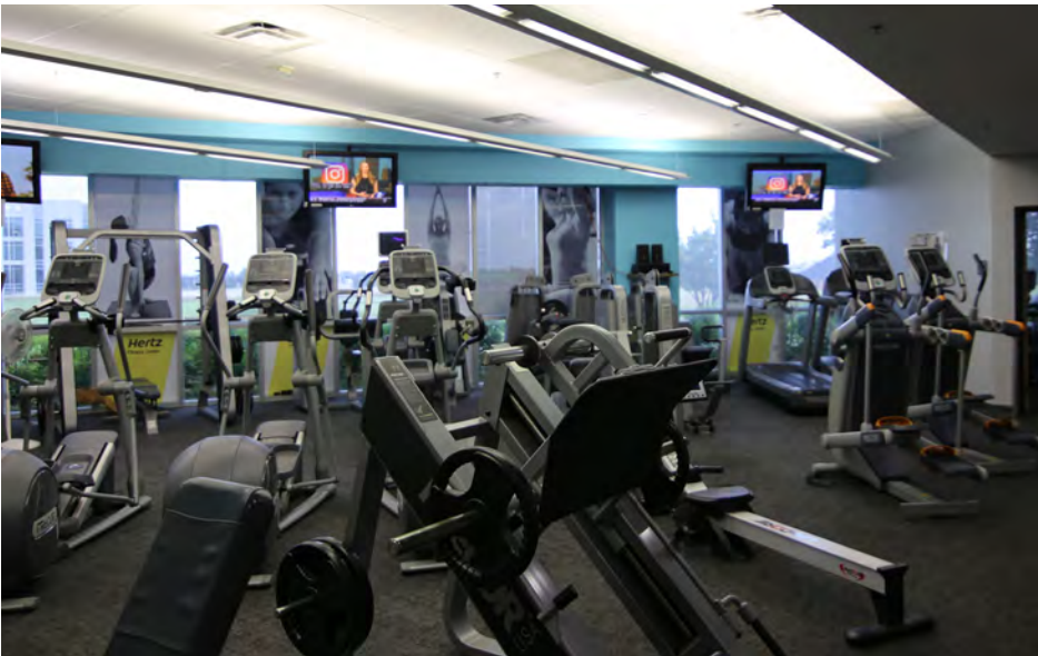
Special Features: Building includes cafeteria and gym