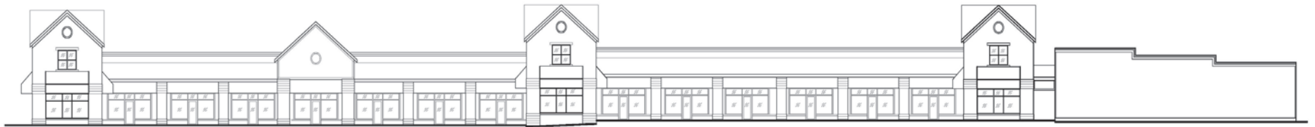
1 EAST ELEVATION A2 1/16" = 1'-0"