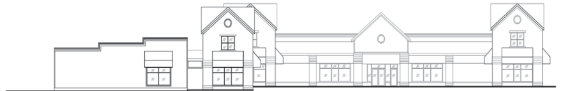
2 SOUTH ELEVATION A2 1/16" = 1'-0"