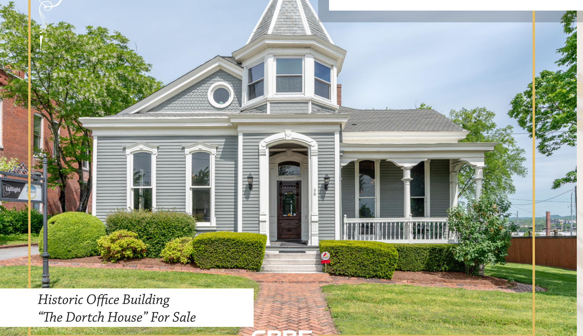
Historic Office Building “The Dortch House” For Sale