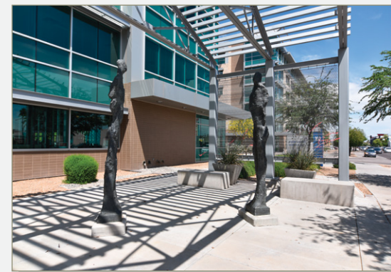
Art Sculptures Facing Seventh Avenue