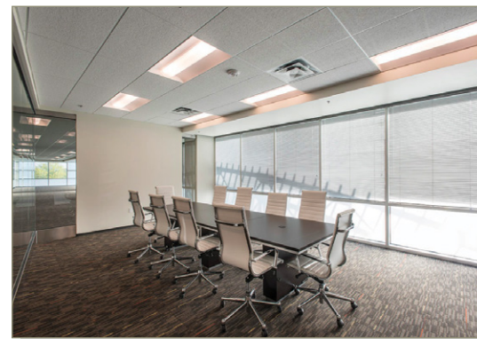
Conference Room in Second Floor Spec Suite