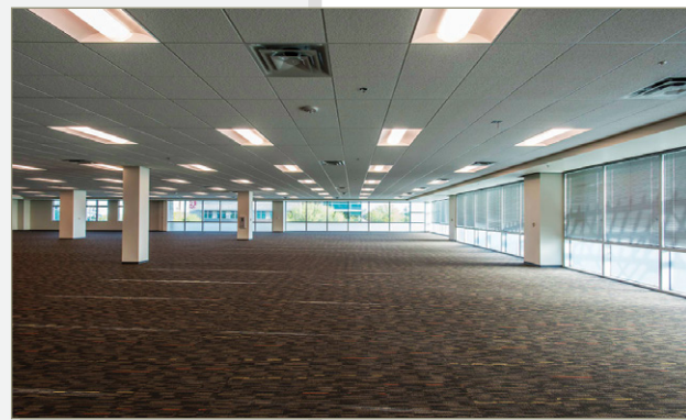
Interior Office Space