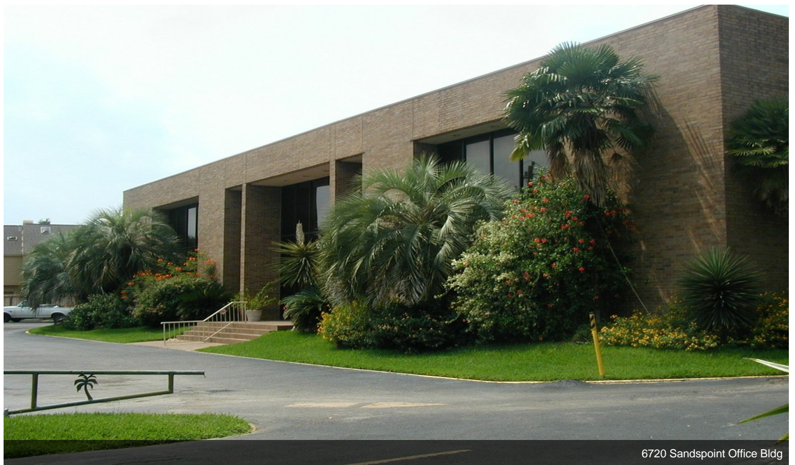
6720 Sandpoint Office Bldg