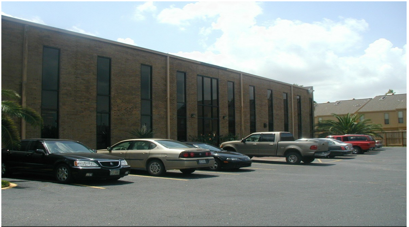
Back of Building