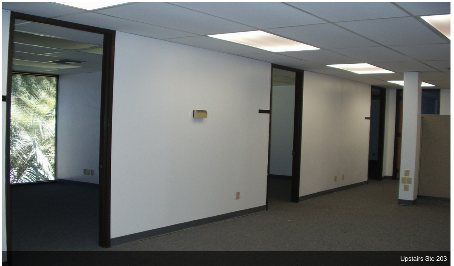
Upstairs Ste 203