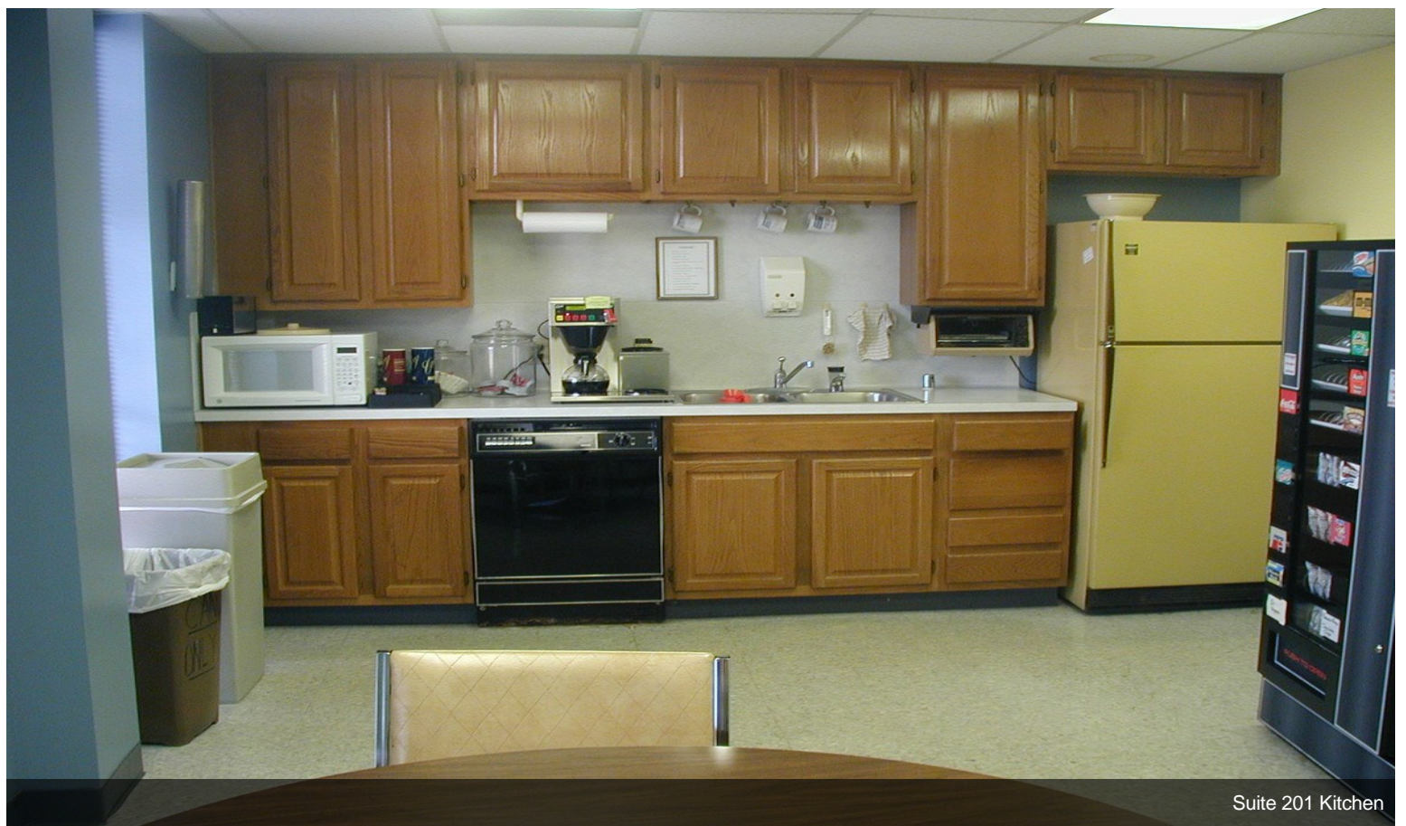
Suite 201 Kitchen