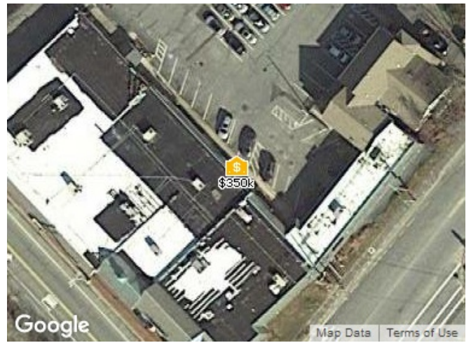
Legend: 🏠 Subject Property