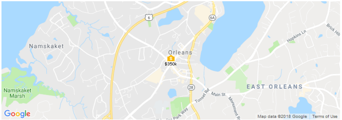
Legend: 🏠 Subject Property