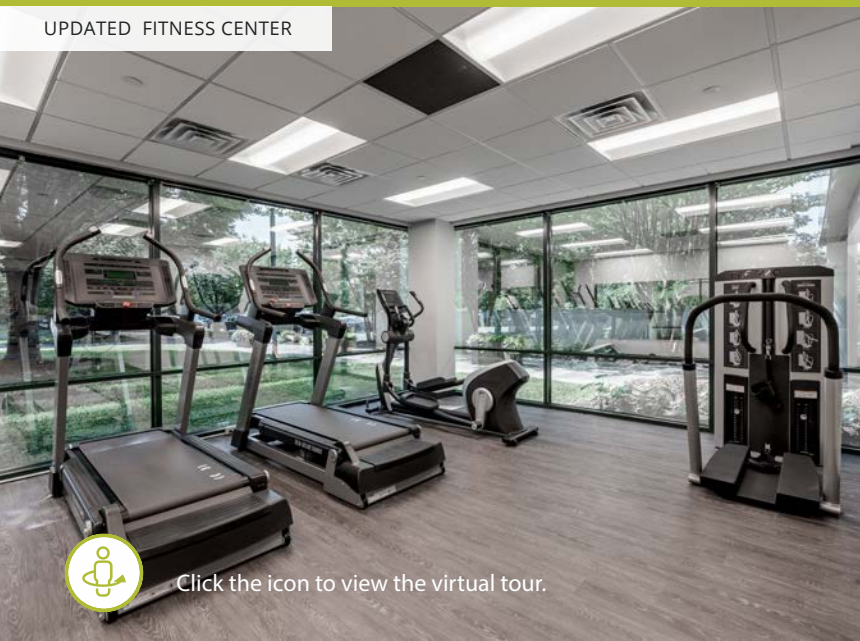
UPDATED FITNESS CENTER