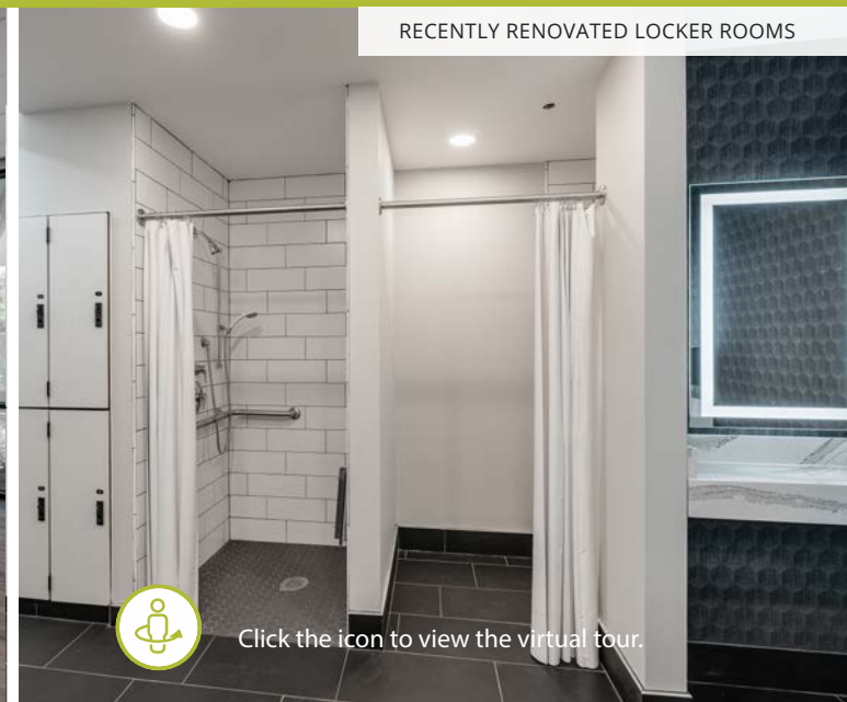
RECENTLY RENOVATED LOCKER ROOMS

Click the icon to view the virtual tour.