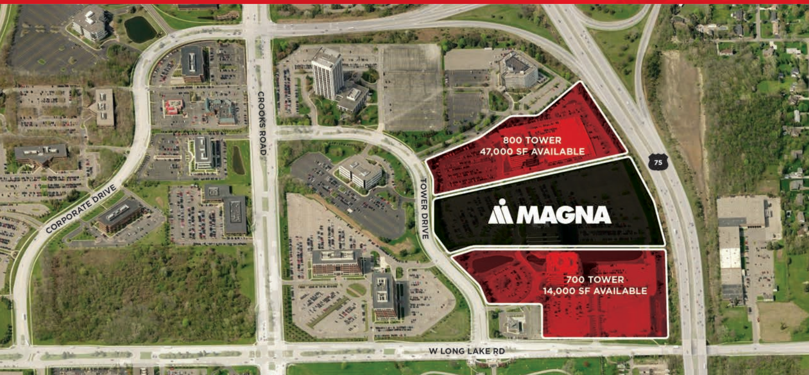
700 TOWER DRIVE