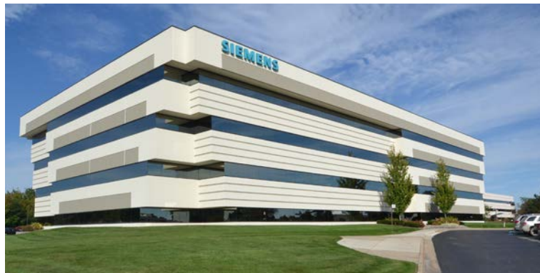
5555 NEW KING DRIVE