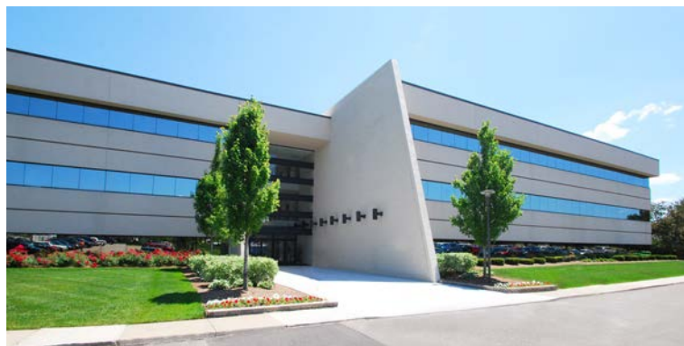
5600 NEW KING DRIVE