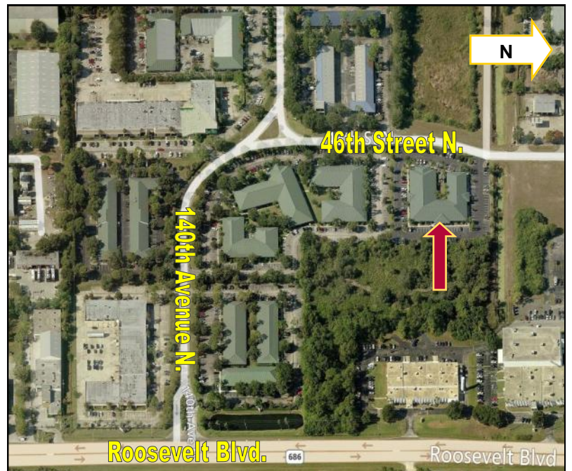
Drawing Not to Scale