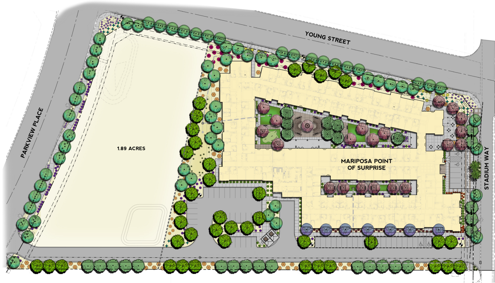
Mariposa Point of Surprise

THOMAS+CROWLEY LANDSCAPE ARCHITECTURE • PLANNING • SITE DESIGN • CONSTRUCTION MANAGEMENT