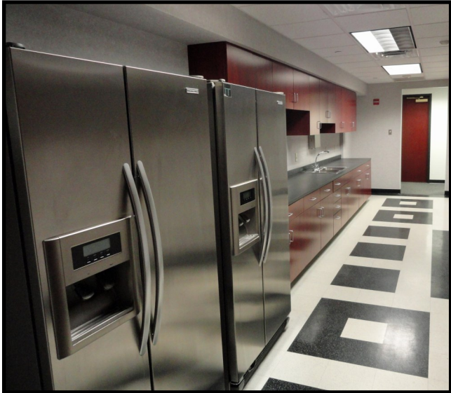
Break Room- Kitchen