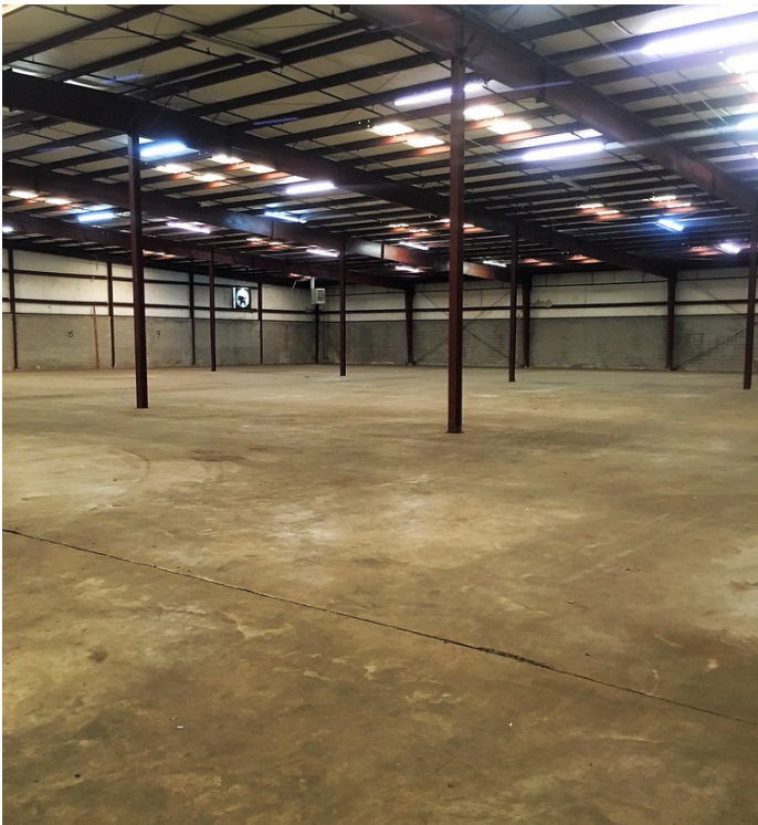
Southeast corner to Northwest Corner