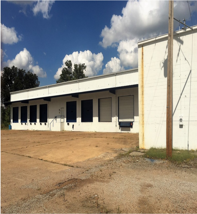
Southwest Loading Dock