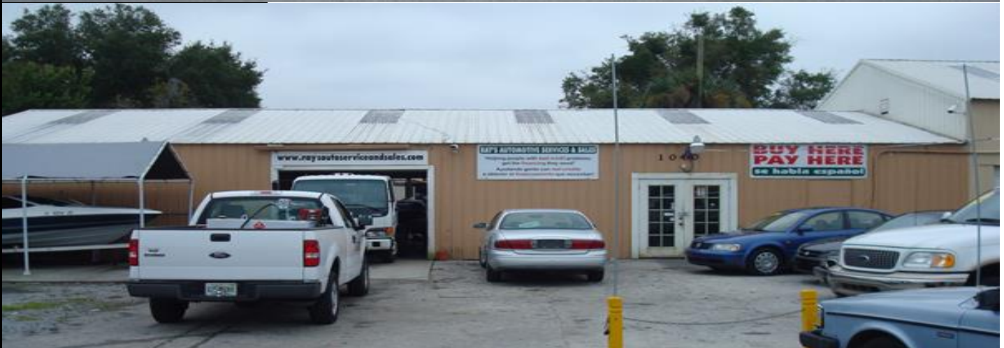
1040 Nursery Road was leased to a car dealer and auto repair facility