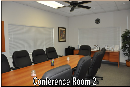
Conference Room 2