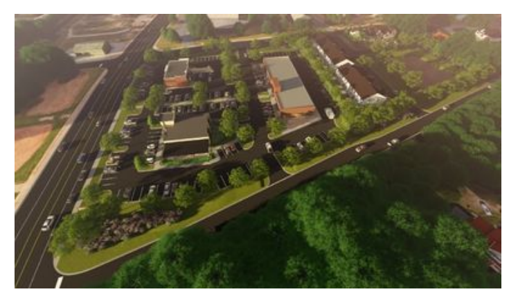
Rendering of possible development