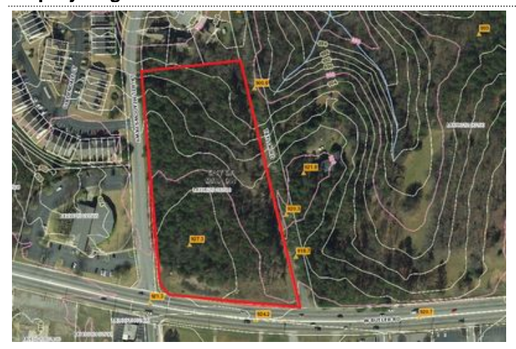
2738 w Bulter Rdtopo