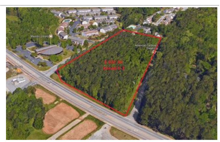
W. Butler Road Mauldin - 5.4+/- acres