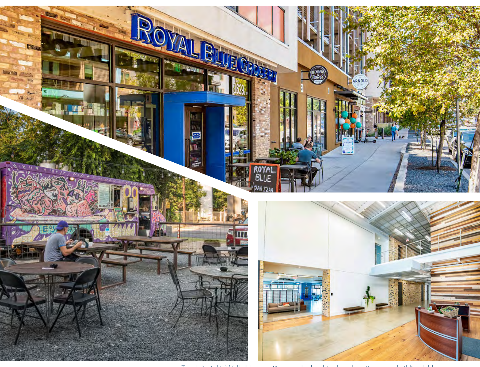
Top, left, right: Walkable amenities, nearby food truck and seating area, building lobby

1645 E. 6TH STREET • AUSTIN, TEXAS 78702