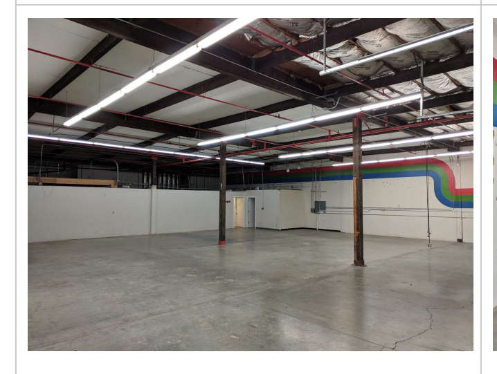
Warehouse and entrance from offices