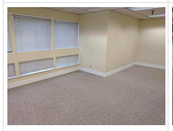
One of three individual office spaces