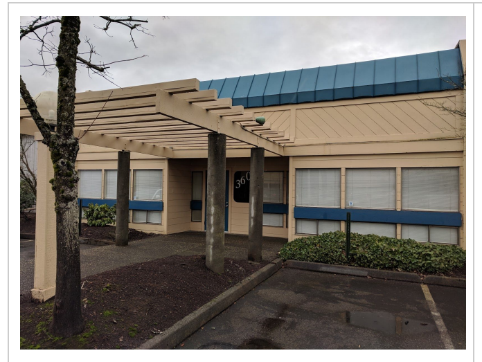
Front entry to reception area and offices