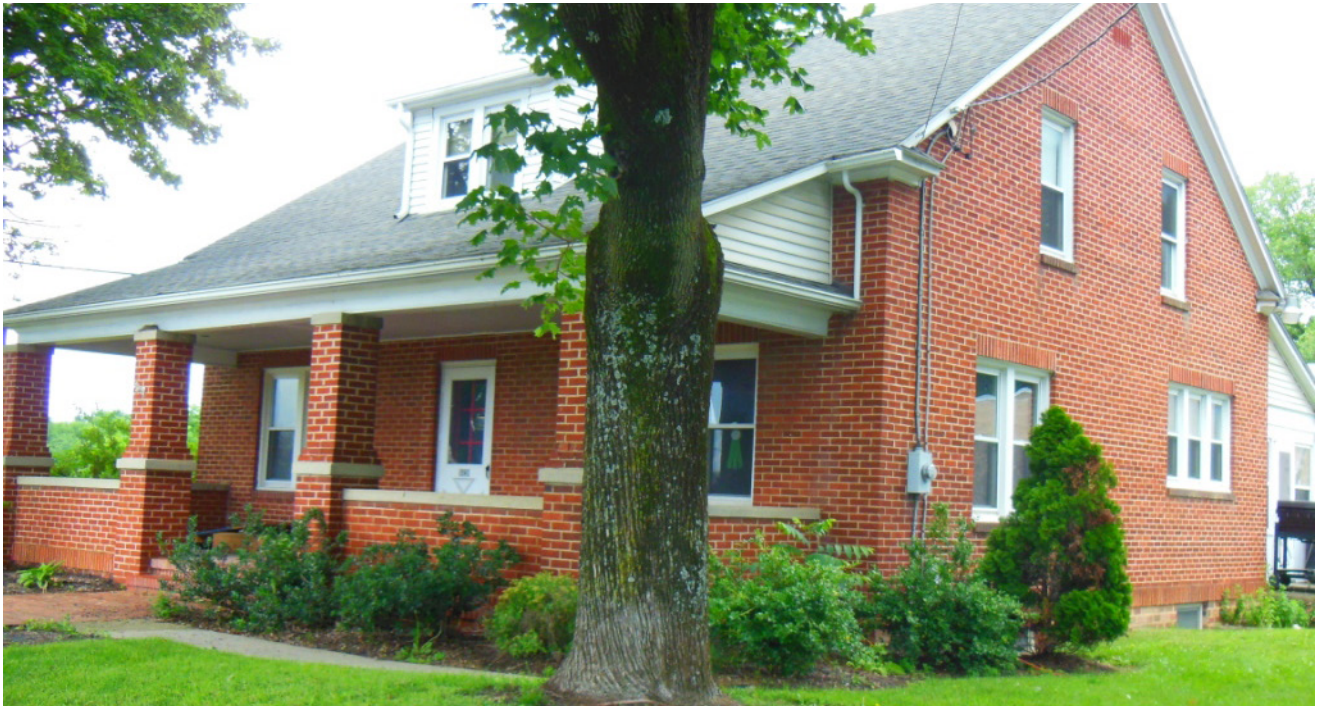
Brick Office Building Currently Leased to Blosser Electric