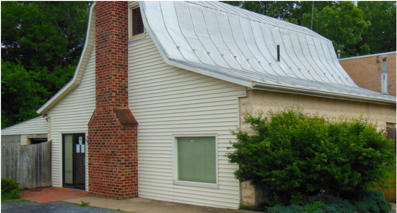
Office Building Currently Leased to ABC Cab Company