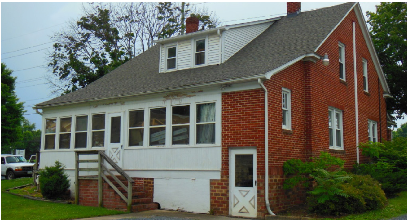
Back View of Brick Office Building