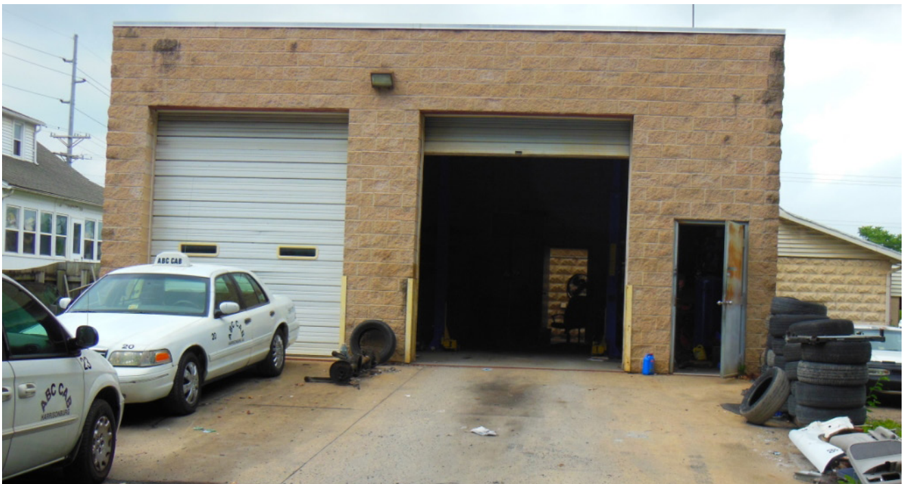
Garage Currently Leased to ABC Cab Company