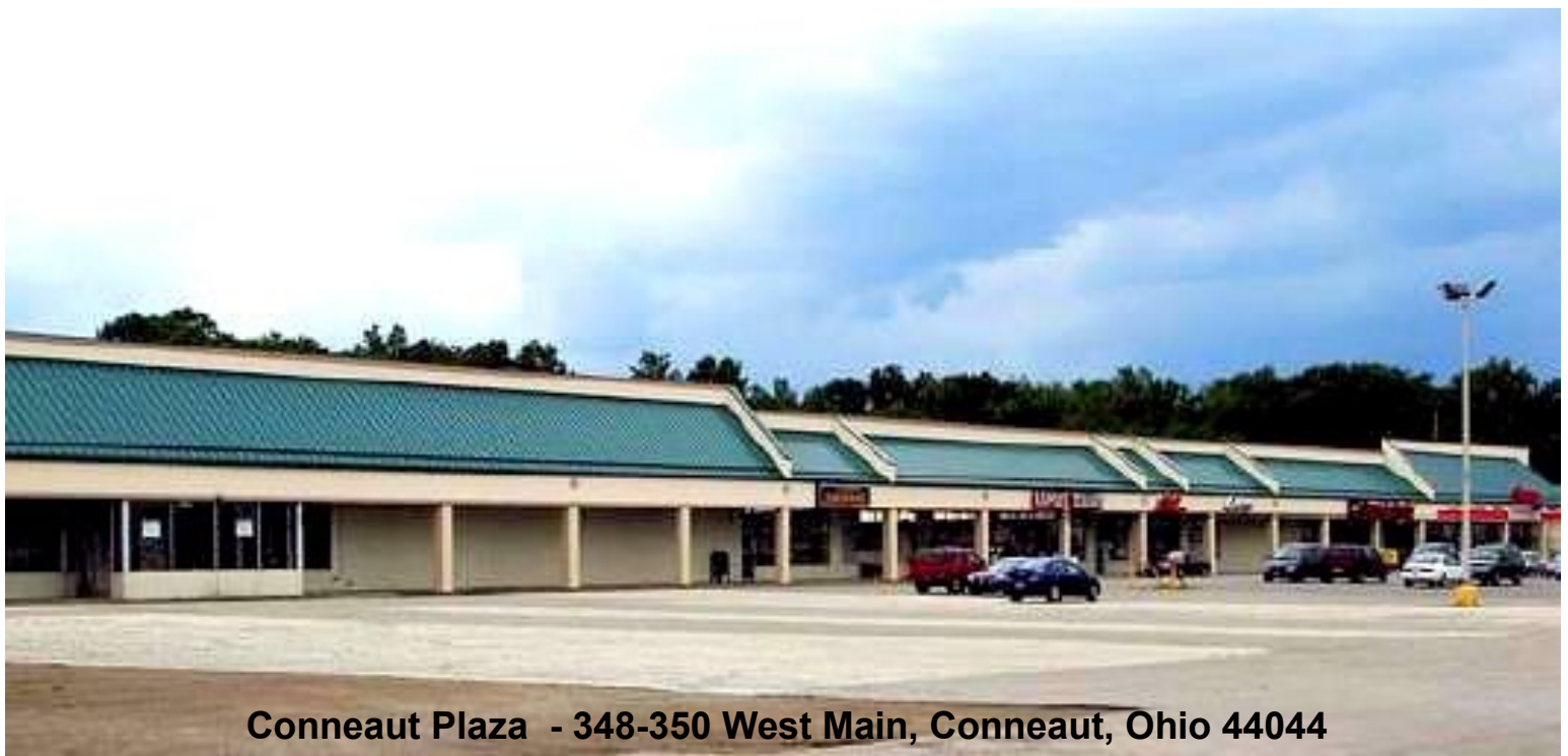
Conneaut Plaza - 348-350 West Main, Conneaut, Ohio 44044