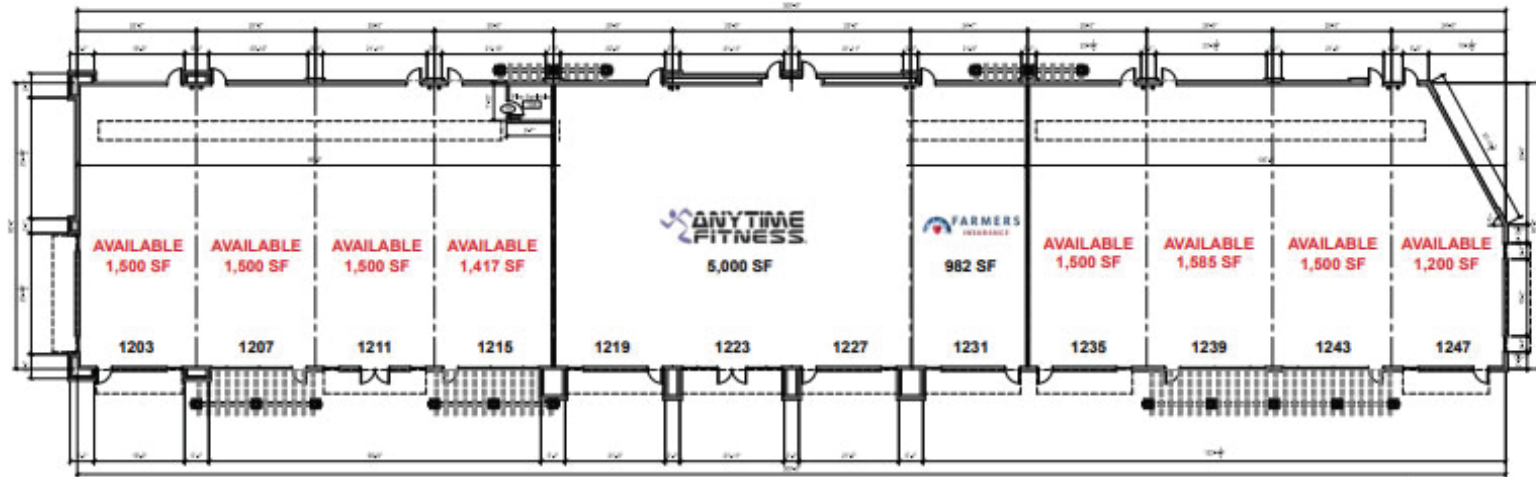
1 floor plan