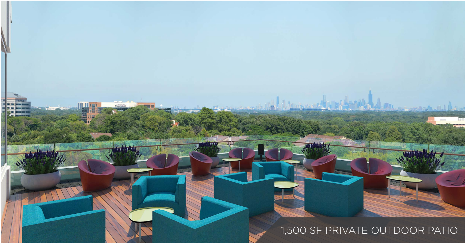
1,500 SF PRIVATE OUTDOOR PATIO