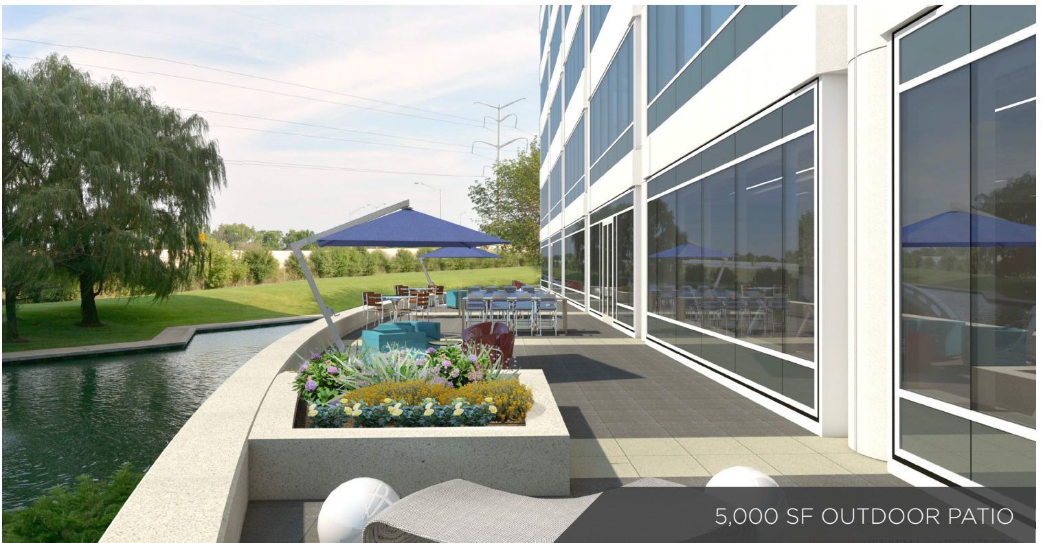
5,000 SF OUTDOOR PATIO