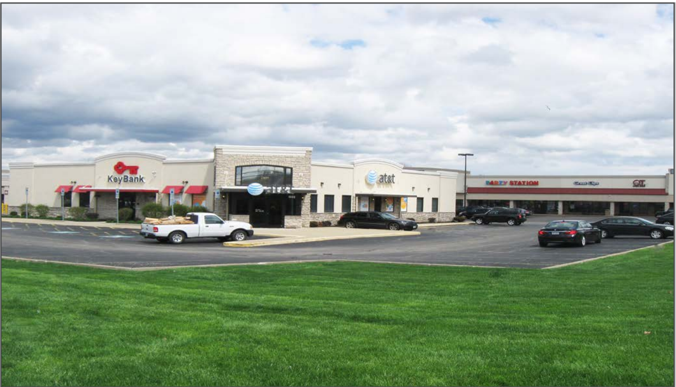
VIEW OF SHOPPES