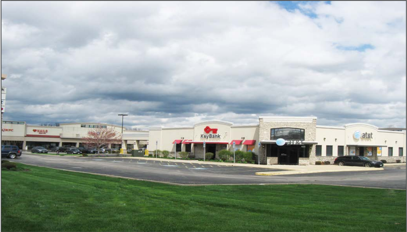
VIEW OF SHOPPES

Retail Space For Lease 1100-1138 North Court Street Medina, Ohio