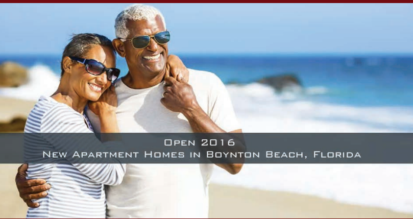
OPEN 2016 NEW APARTMENT HOMES IN BOYNTON BEACH, FLORIDA

expansive pool. As discerning consumer preferences evolve and the convergence of health and wellness priorities permeate quality of life sustainability, neighboring retailers provide an added cosmopolitan approach to healthy living in a mixed-use environment. The benefit: an unsurpassed retail experience, complete with convenient access to a wide array of restaurants, spas, personal, and medical services. At 500 Ocean, Boynton Beach residents and the surrounding footprint have easy access to a refined "cross-shopping", community-centric approach to active living.