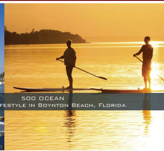
500 OCEAN LIVE THE LIFESTYLE IN BOYNTON BEACH, FLORIDA