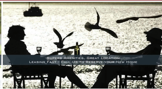
SUPERB AMENITIES, GREAT LOCATION LEASING FAST - CALL US TO RESERVE YOUR NEW HOME