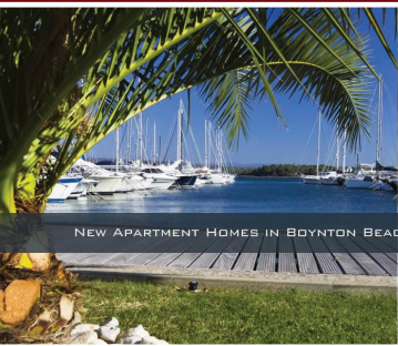
NEW APARTMENT HOMES IN BOYNTON BEACH, FLORIDA