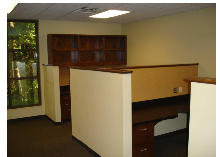
Four Large Work Cubicles