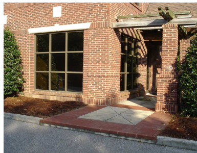
Private entrance to Lobby

Approximately 1,510 SF including utilities, security and cabled for IT.