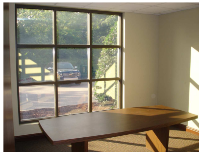
Conference Room or Second Private Office.....With Wet Bar