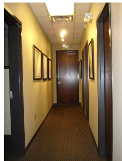
Hallway Men's and Ladies