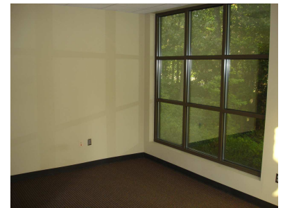
Corner Executive Suite