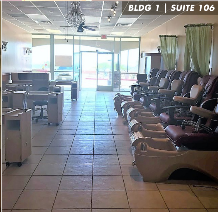
BLDG 1 | SUITE 106