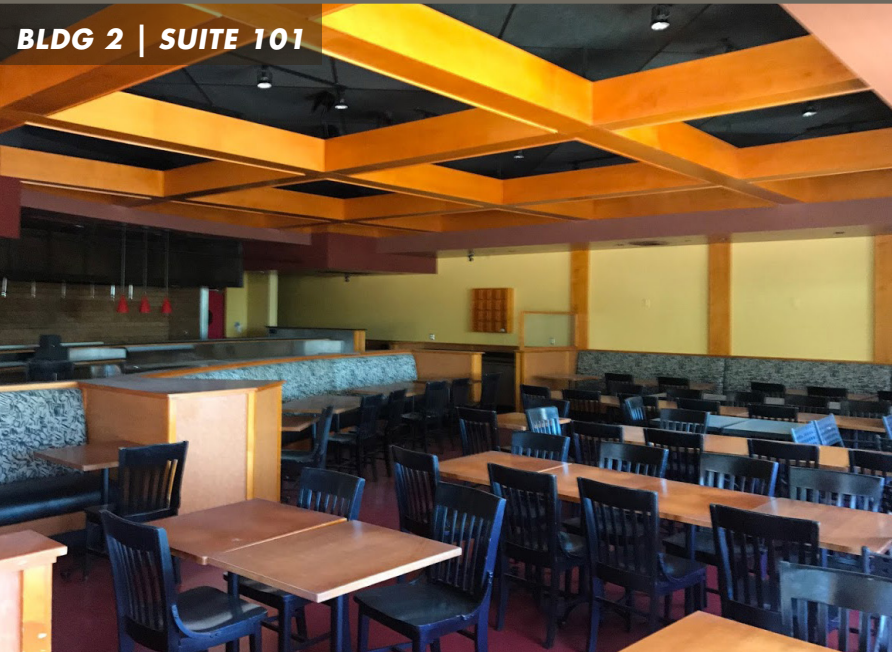
BLDG 2 | SUITE 101