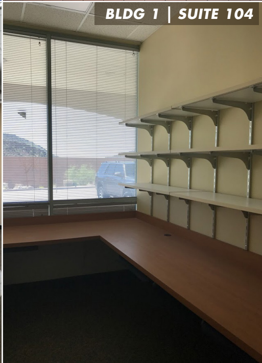
BLDG 1 | SUITE 104