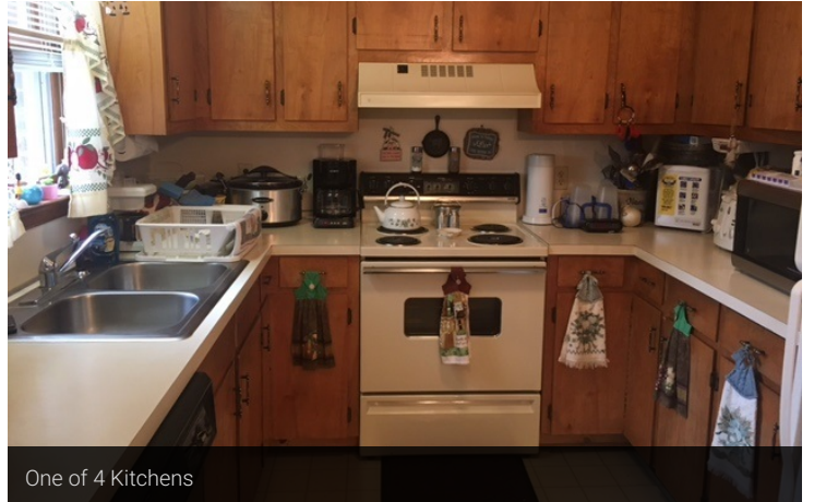
One of 4 Kitchens