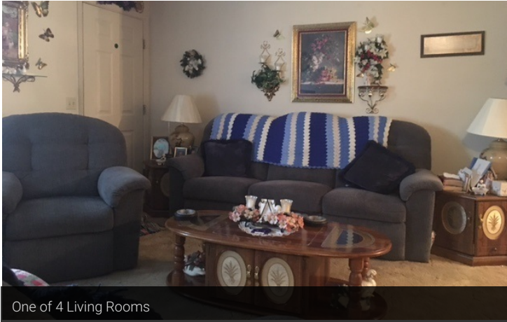
One of 4 Living Rooms