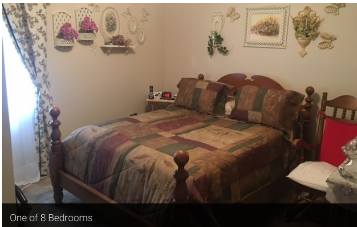
One of 8 Bedrooms