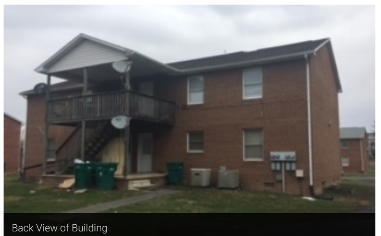
Back View of Building