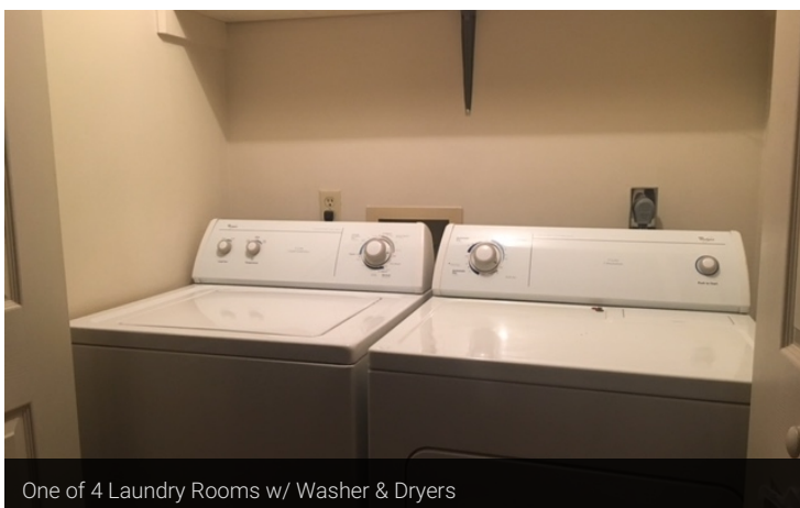
One of 4 Laundry Rooms w/ Washer & Dryers