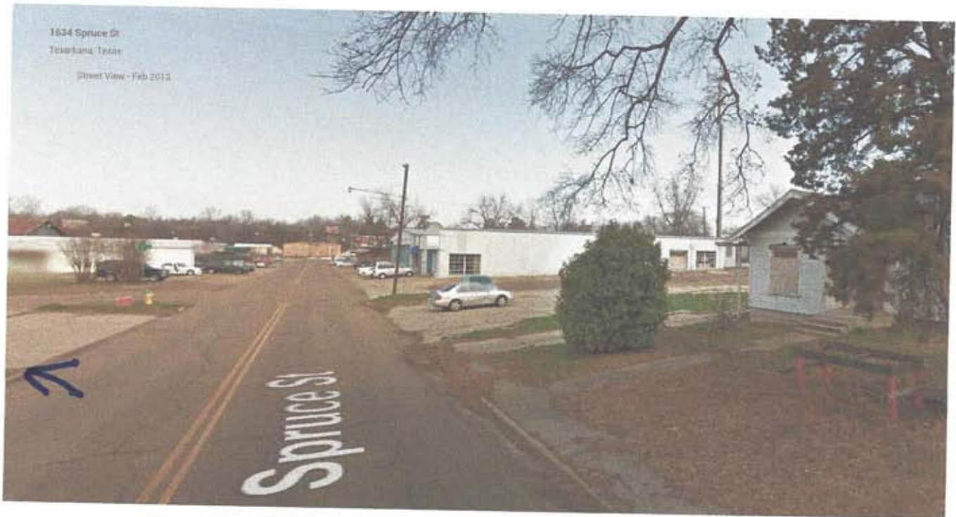
Street View to right