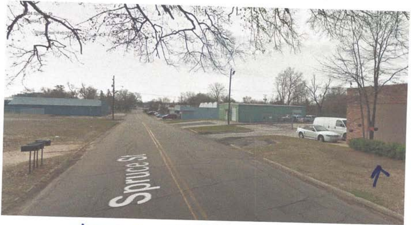
Street view to left