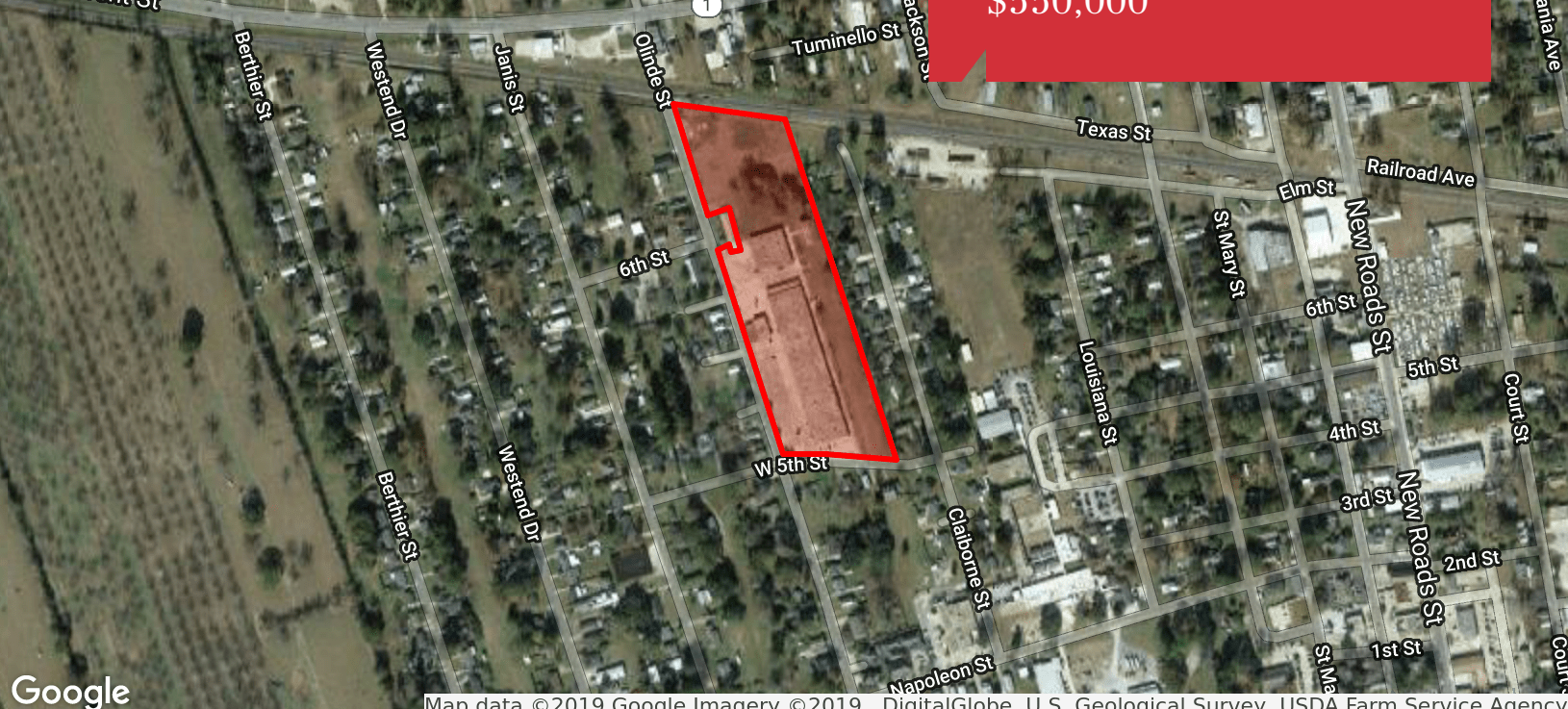
Map data ©2019 Google Imagery ©2019 , DigitalGlobe, U.S. Geological Survey, USDA Farm Service Agency