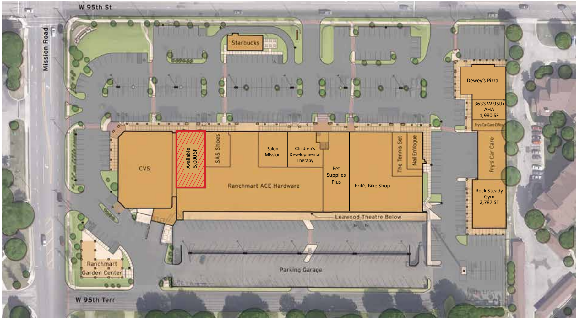
Ranch Mart South Site Plan- Ground Level