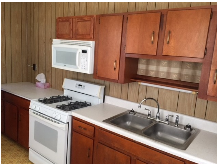
Apartment kitchen area