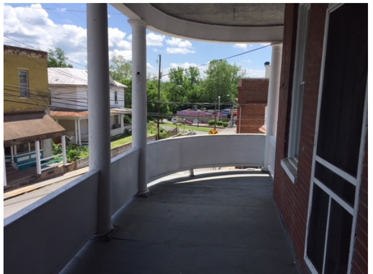
Private 2nd floor covered porch area