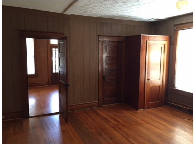
Upstairs 2/3 bedroom apartment