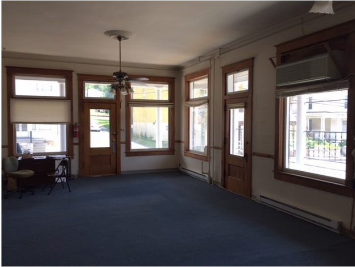
Potential office / retail / or apartment area