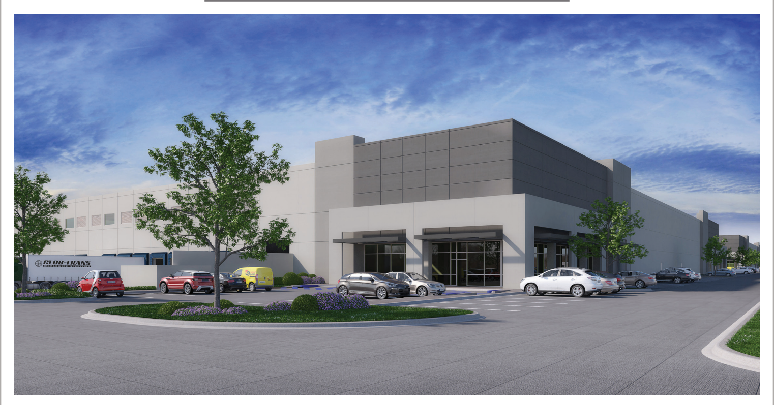
1801 S SHILOH ROAD | GARLAND, TEXAS 75042