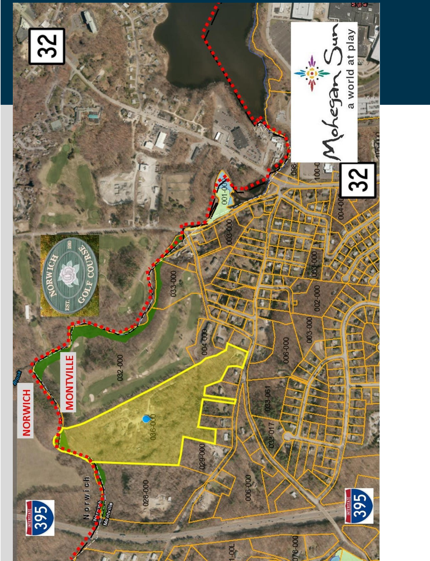
Information deemed reliable but not guaranteed and offerings subject to errors, omissions, change of price or withdrawal without notice.