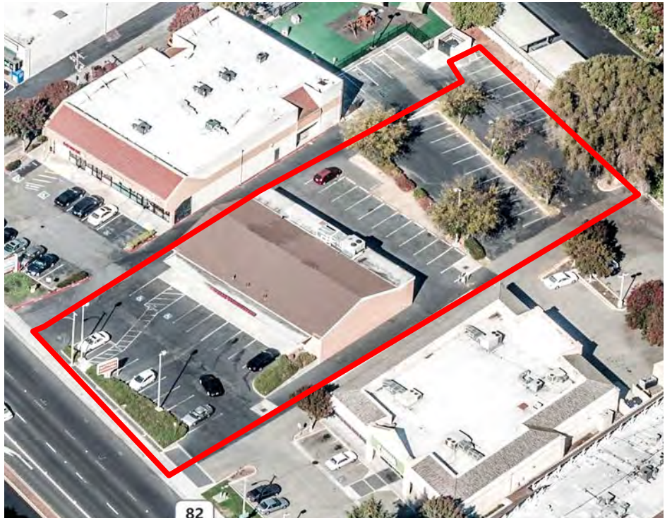
Large Parking Areas Behind Building and Out Front

MEACHAM/OPPENHEIMER, INC. CORFAC INTERNATIONAL 8 No. San Pedro St., Suite 300 San Jose, California 95110 Tel: 408.378.5900 www.moinc.net