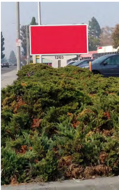
Prominent Monument Signage