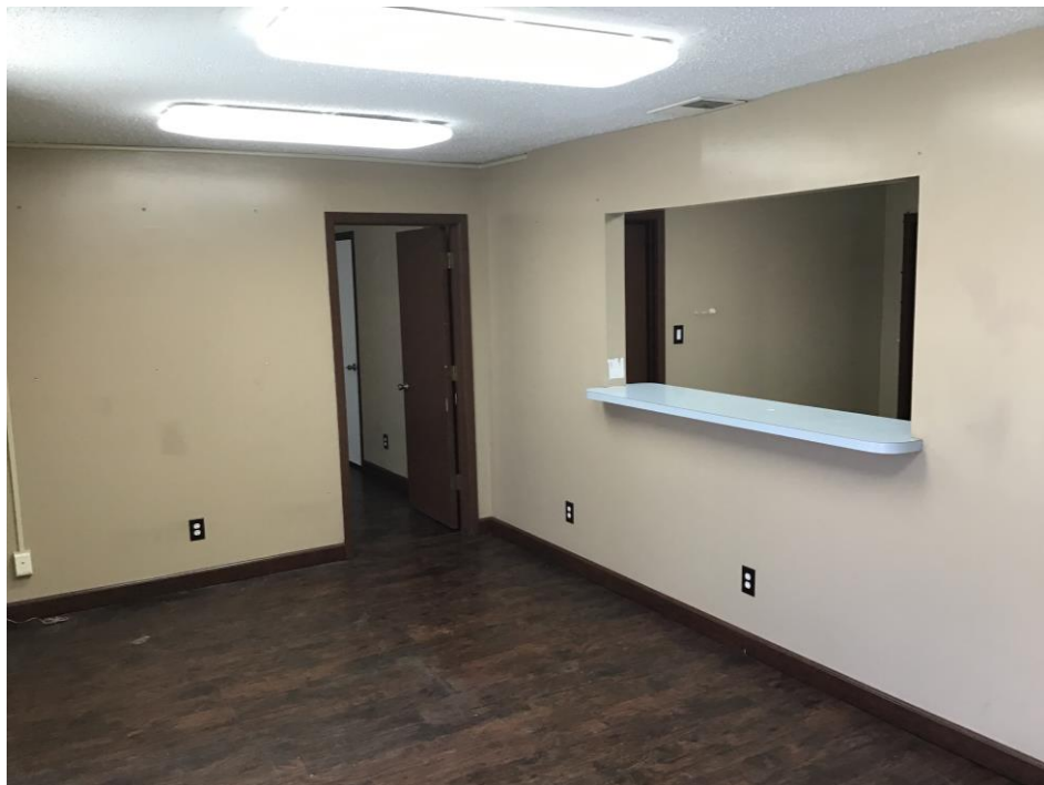
Front Shop Office(s)