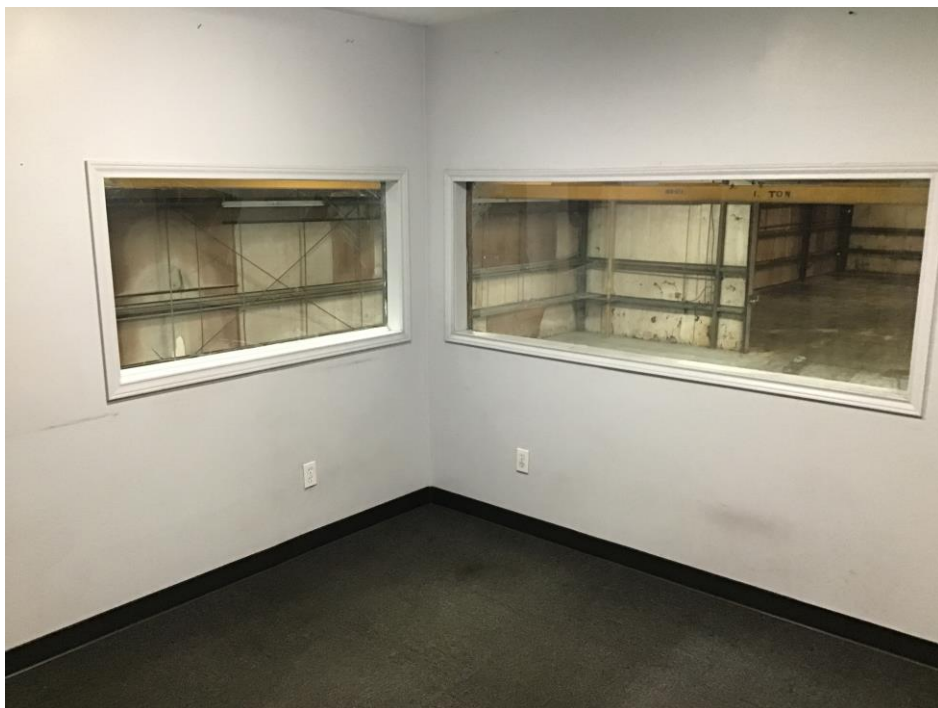
Front Shop 2 nd Level