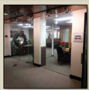
Well managed... Well maintained... An ideal place to work.