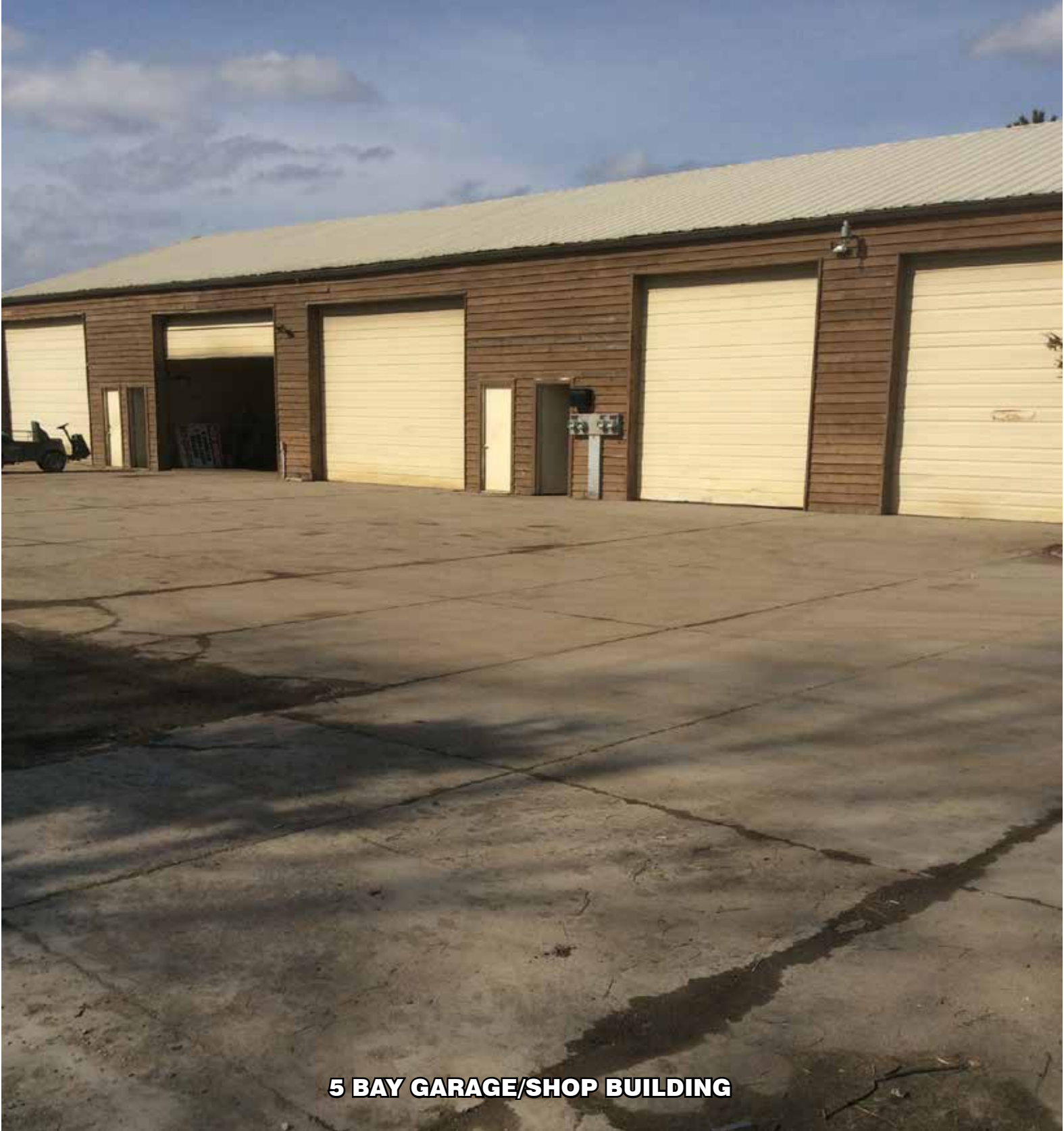
5 BAY GARAGE/SHOP BUILDING