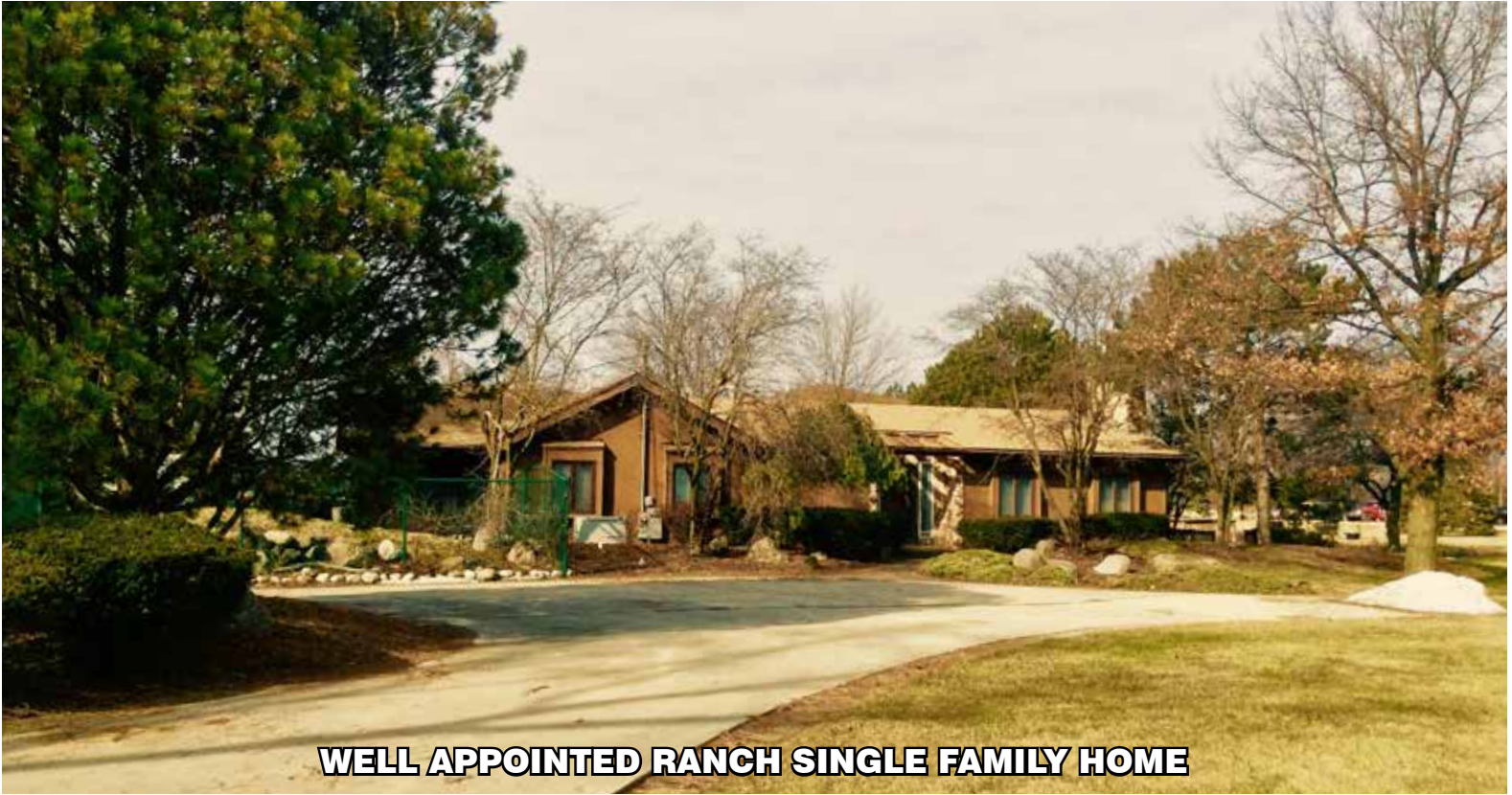
WELL APPOINTED RANCH SINGLE FAMILY HOME