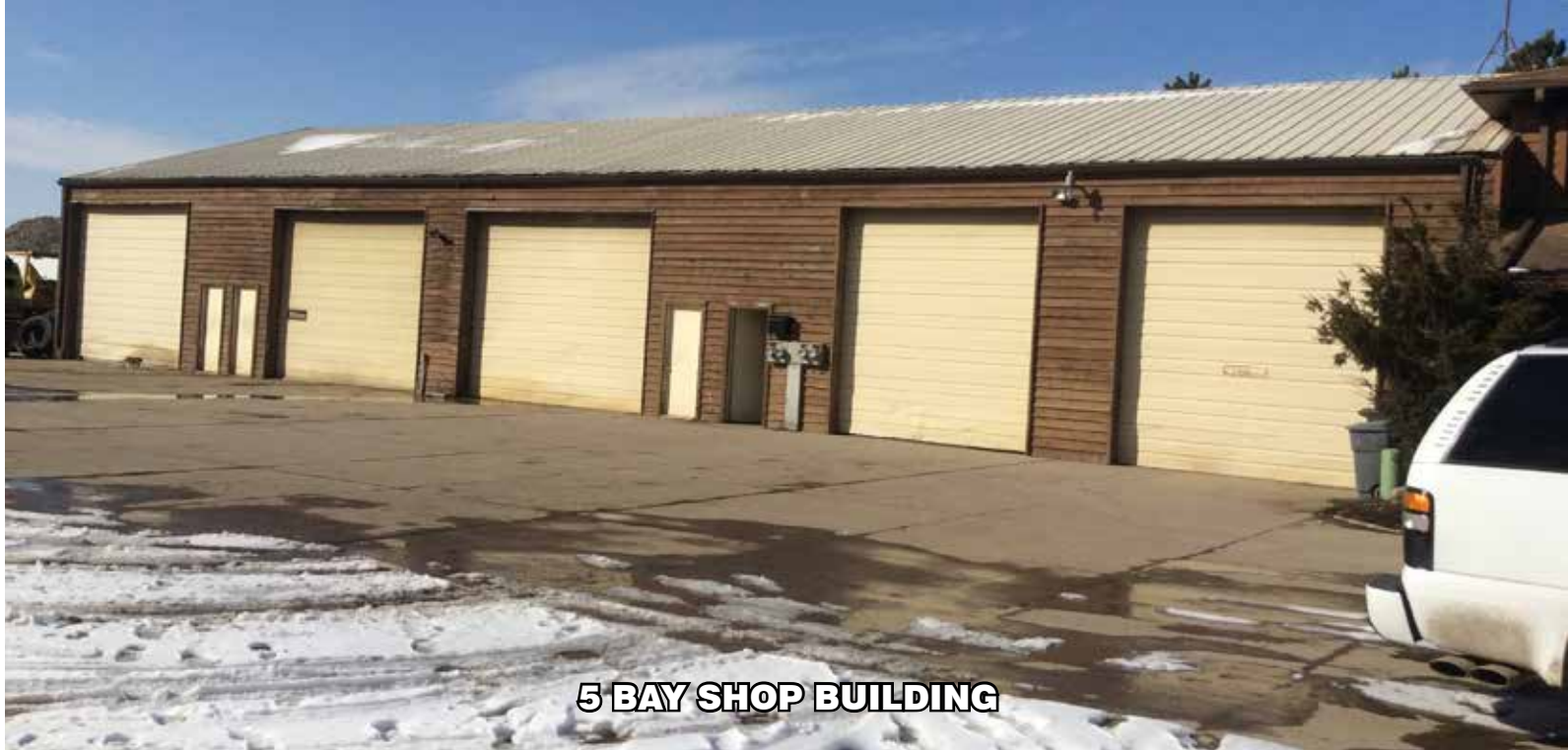
5 BAY SHOP BUILDING

LEE & ASSOCIATES COMMERCIAL REAL ESTATE SERVICES