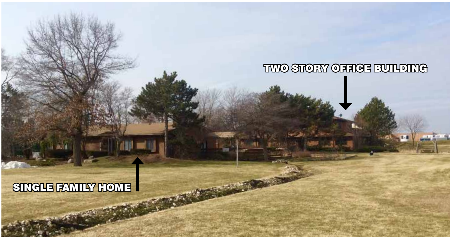
TWO STORY OFFICE BUILDING