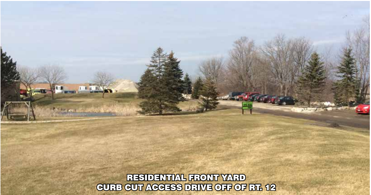
RESIDENTIAL FRONT YARD CURB CUT ACCESS DRIVE OFF OF RT. 12