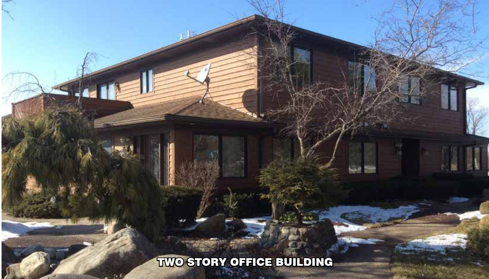
TWO STORY OFFICE BUILDING