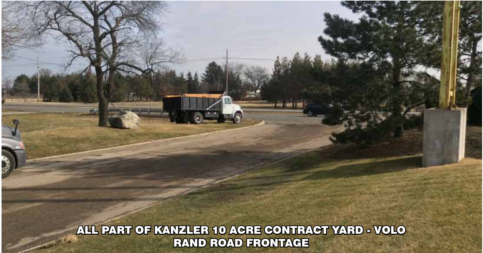
ALL PART OF KANZLER 10 ACRE CONTRACT YARD - VOLO RAND ROAD FRONTAGE