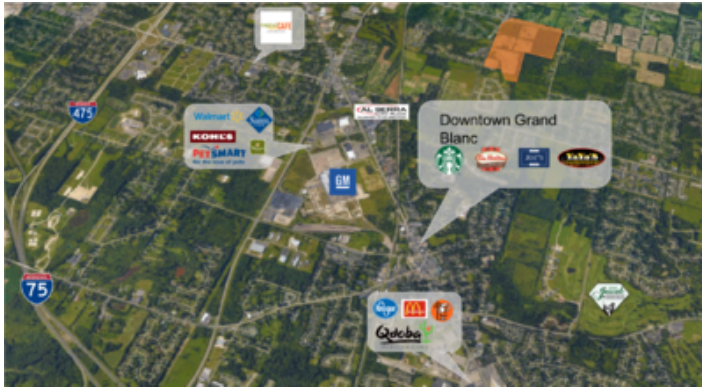
Grand. Blanc Aerial