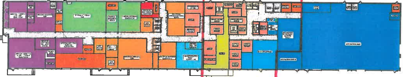
WATERTOWN CAMPUS BUILDING 'A' PLAN