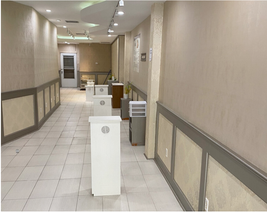
CONTACT OUR BROKER FOR MORE INFORMATION: