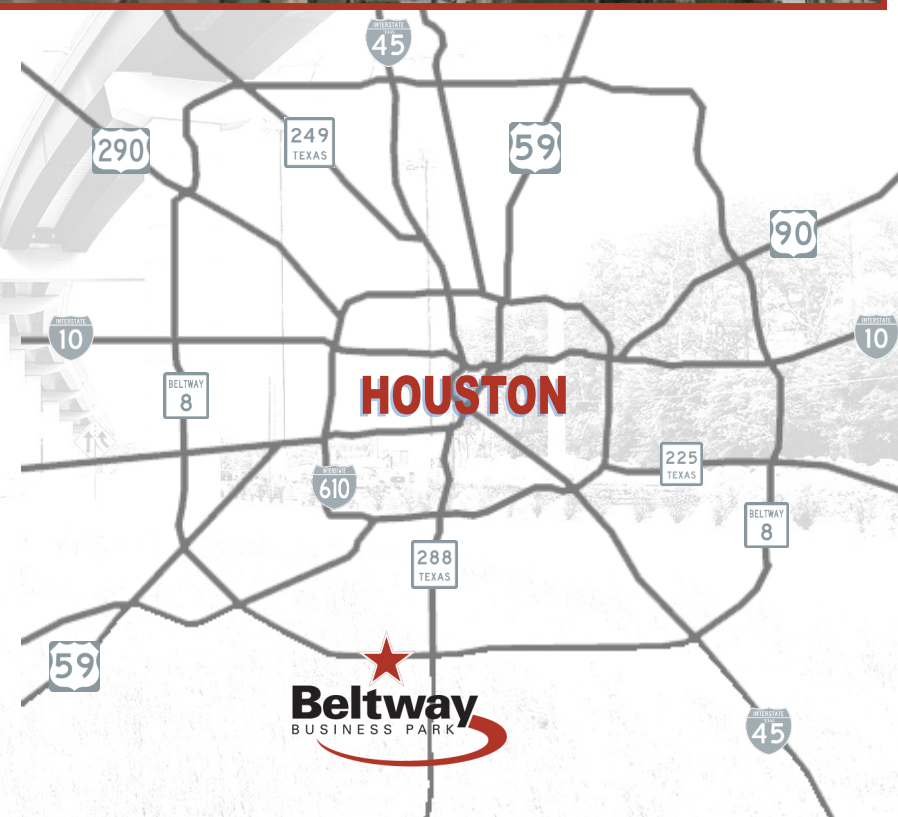
Drive Times (Minutes) to Major Corridors