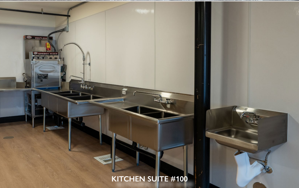
KITCHEN SUITE #100