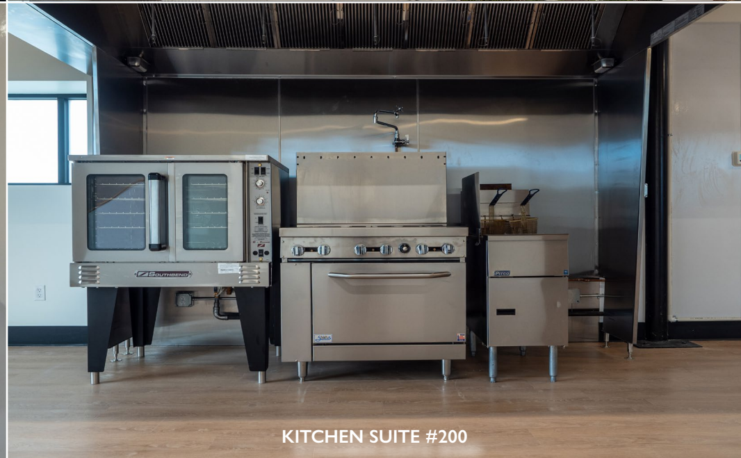
KITCHEN SUITE #200