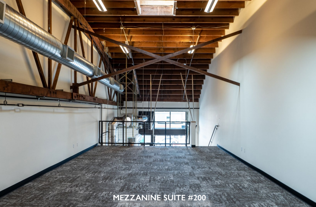
MEZZANINE SUITE #200