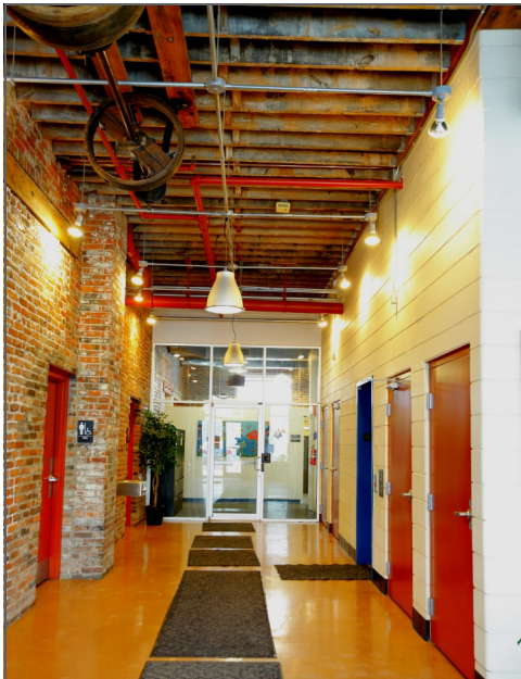
FIRST FLOOR LOBBY