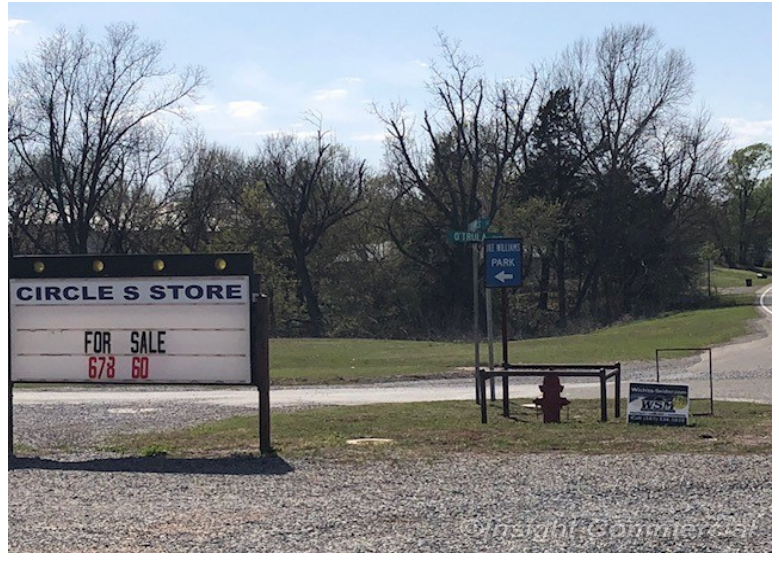
2 E James St., Sterling, OK