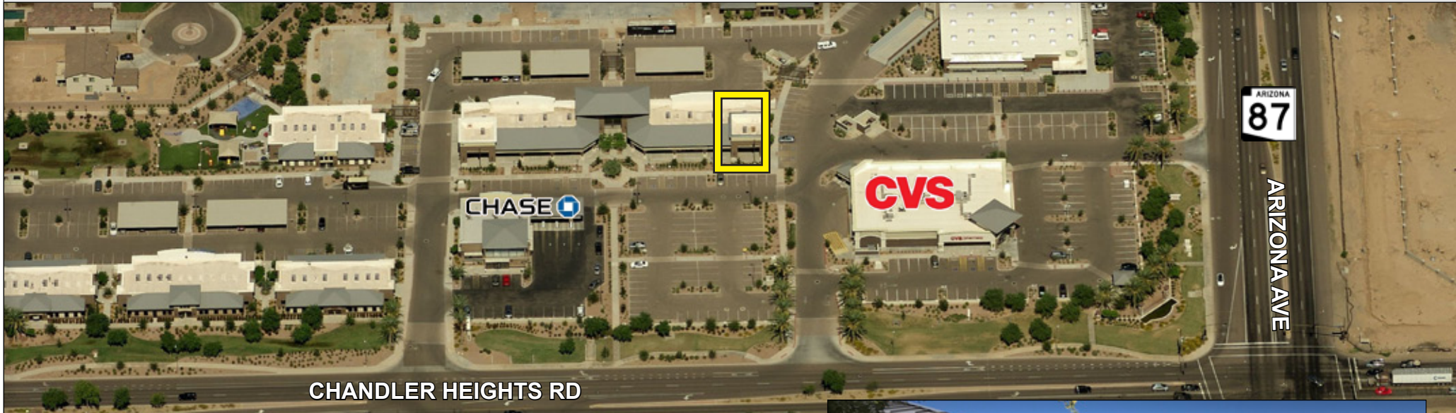
CHANDLER HEIGHTS RD

208 W. Chandler Heights Rd, Suite 101 | Chandler, AZ 85248