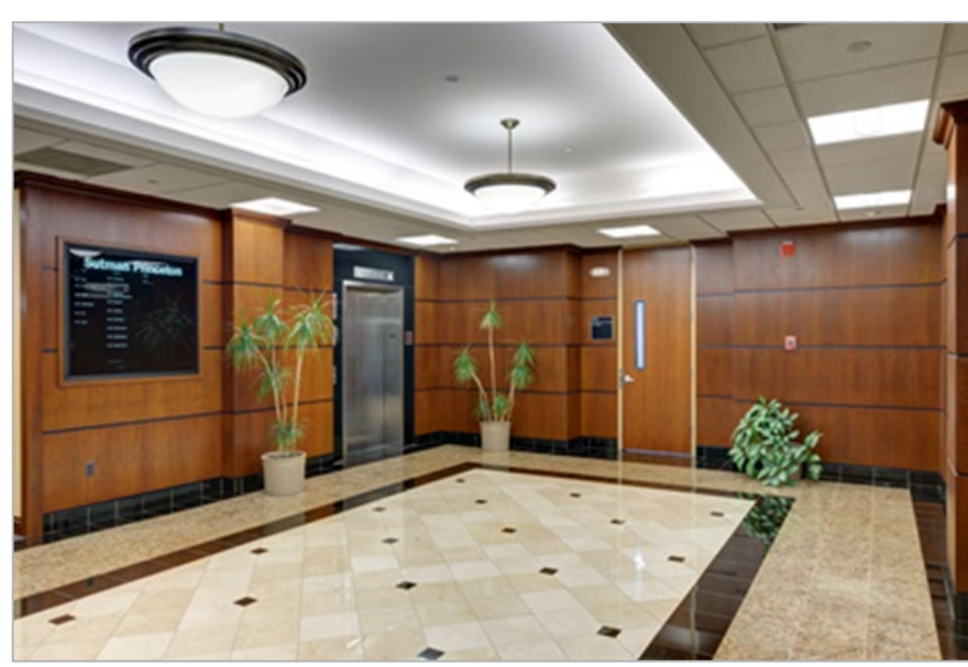
Suite 230 & 202 -5,143 SF